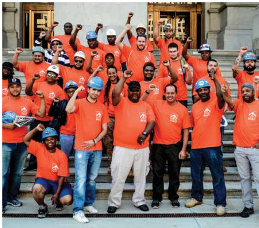
Local 79 members in Albany (left) and apprentices (right) in Albany