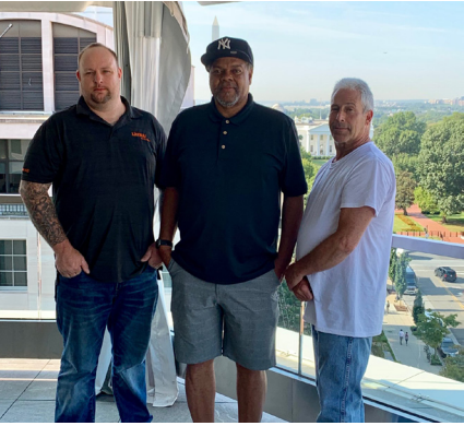
9/11 Organizers & Retirees went to Washington D.C. to fight for funding the 9/11 Victim Compensation Fund.